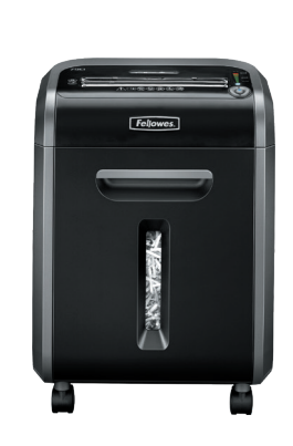
Personal Use 16 Sheets 6 Gallon Bin